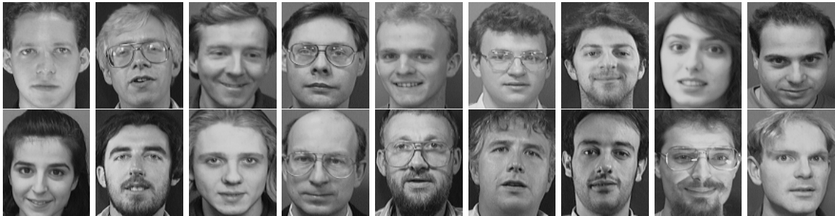
Figure 2: Samples face images from the AT&amp;T database of faces.

All the images were taken against a dark homogeneous background with the subjects in an upright, frontal position (with tolerance for some side movement). The complete database contains 400 grayscale face images of size 92 \times 112 pixels.