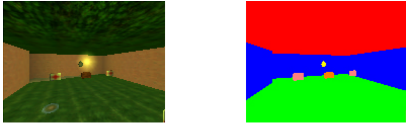
Figure 1. On the left is the actual world rendered from the character’s point of view. On the right, the world is rendered as using the synthetic vision module from the same point of view. Pink is used for a health power-up, orange for an ammunition power-up, yellow for a flying ball, green for the floor; blue for the wall and red for the ceiling.

effectively used to provide for two different kinds of semantic information. Both use false colouring to present a rendered view of the autonomous agent’s field of view. The first viewport represents static information and the second viewport represents dynamic information. Together the two viewports can be used to control agent behaviour. We discuss only the implementation of simple memoryless reactive behaviour; although far more complex behaviour is implementable by exploiting synthetic vision together with the consideration of memory and learning. Our synthetic vision module is used to demonstrate low-level navigation, fast object recognition, fast dynamic object recognition and obstacle avoidance.